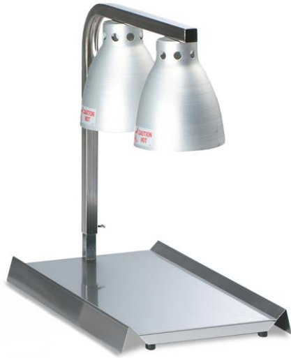
Two Lamp Food Warmer