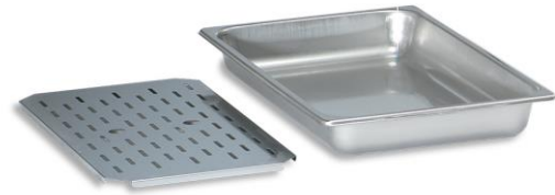
5056 Accessory Pan Kit shown above for reference only (sold separately)