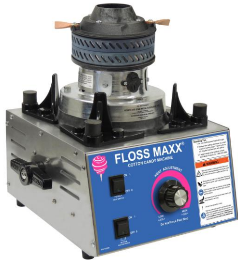
Unit view without Floss Pan