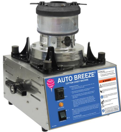
Unit view without Floss Pan