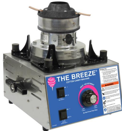
Unit view without Floss Pan