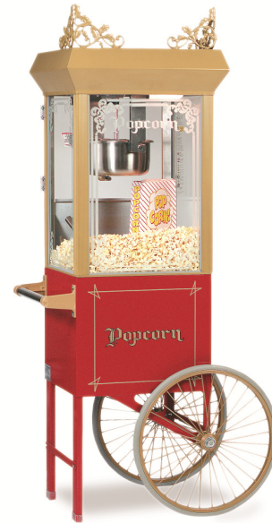
Cart shown with Popper (Popper sold separately.)