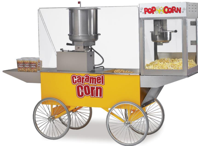
Karmel Kool Wagon with built in Karmel Kool system.