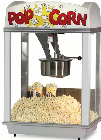
General reference image shown.