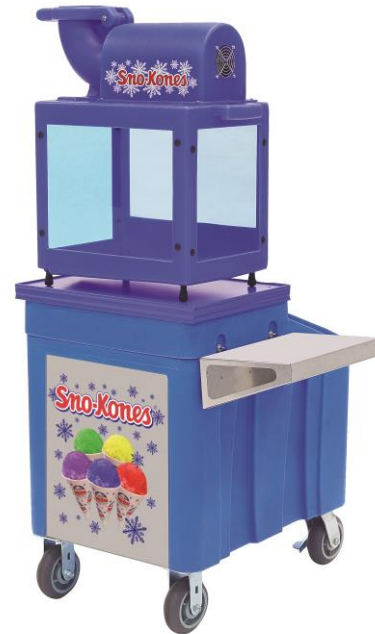
Caddy shown with Ice Shaver Unit for reference only (items sold separately)