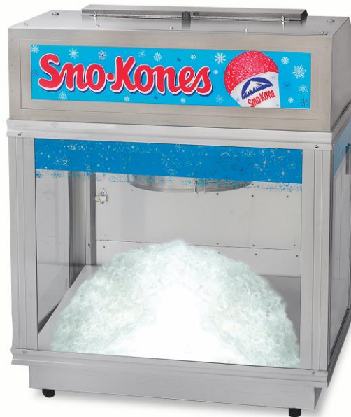
General image shown for reference only.